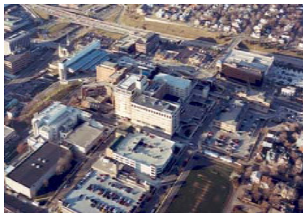
Spectrum Health, Butterworth Campus

The Spectrum system is composed of one 3.8 MW gas fired generator, whose waste heat is recovered by an exhaust gas heat recovery steam generator (19,000 lb/hr of 125 psi steam). During summer, this steam is converted in two absorption chillers for cooling, which are supplemented by 3 electric chillers. In 2004, the system met approximately 50% of the hospital's summer electricity load, and 75% of the winter load. Almost all of the hospital's annual steam needs are met through cogeneration, with the emergency or supplemental steam available through a contract with the county.