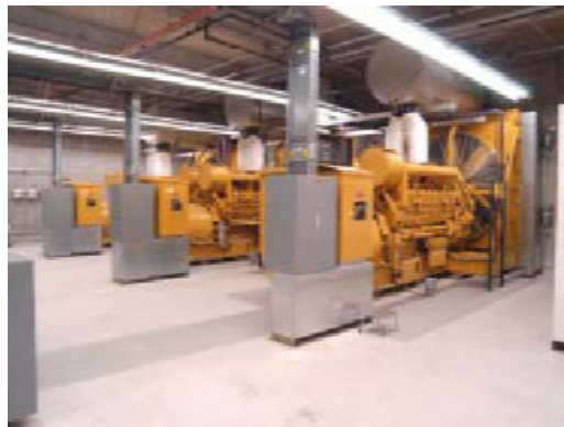
Three 2 MW Diesel Generators Provide Emergency Power