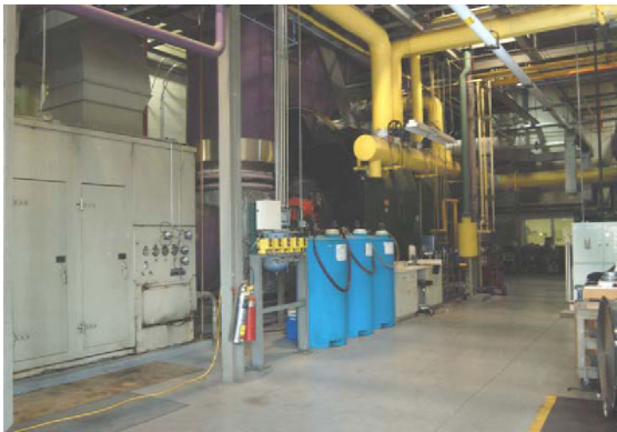
3.8 MW Natural Gas Fired Turbine

Almost all of the hospital's annual steam needs are met through Combined Heat and Power.