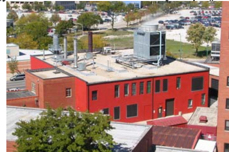
Jesse Brown VA Hospital Energy Center

In November 2003, a 3.4 MW Combined Heat and Power system was installed at the Jesse Brown Veterans Affairs Medical Center to provide electricity and steam to the medical facility. The CHP system offered energy independence and security to the hospital. The CHP system consists of a Solar Centaur 40™ combustion turbine fueled by natural gas with a maximum steam generating capacity of 50,000 lbs/hr when duct-fired. At an installed cost of $12.5 million, the CHP system tied in with the energy center will save $41 million in energy costs over the life of the 25 year project lease.