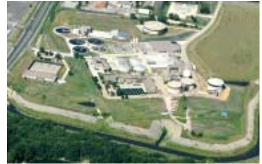
Rochester Wastewater Reclamation

Two continuous mix digesters (1.85 million gallon each)