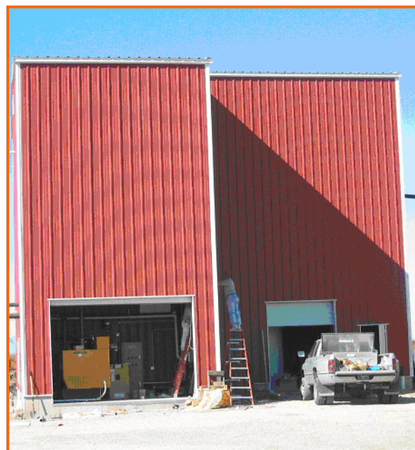
Digester and engine room

LOCATION: West Weber, Utah SIMPLE PAYBACK: 5 years with government grants, or 10 years without (if <60% of the heat can be profitably used) TOTAL PROJECT COST: $760,000, or $633/cow CONTRACT W/ UTILITY: 4.7¢/kWh ANNUAL SAVINGS: $50,000-$60,000 (reduced energy costs and manure handling costs) EQUIPMENT: Induced Blanket Reactor digester, 150-kW Caterpillar engine genset, heat recovery FUEL: Renewable biogas from dairy manure USE OF THERMAL ENERGY: Heating the digester FACILITY SIZE: 1200 cows FACILITY AVERAGE LOAD: 20 kW CHP IN OPERATION SINCE: 2004 ENVIRONMENTAL BENEFITS: Reduced odor, pathogens, water pollution, methane emissions and fossil fuel use