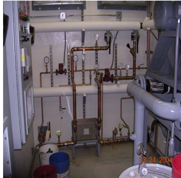
Figure 3: Heat Recovery System

When either of the smaller units is ready for replacement a marine manifold unit of similar capacity should be installed to increase the amount of jacket water heat available for recovery.