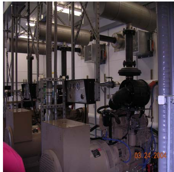
Figure 1: Kokhanok Power Plant

925 Plum St SE, Bldg 4 • P.O. Box 43165 • Olympia, WA 98504-3165 (360) 956-2004 • Fax (360) 236-2004 • TDD: (360) 956-2218