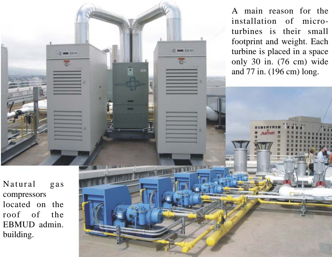
Natural gas compressors located on the roof of the EBMUD admin. building.

A main reason for the installation of micro-turbines is their small footprint and weight. Each turbine is placed in a space only 30 in. (76 cm) wide and 77 in. (196 cm) long.